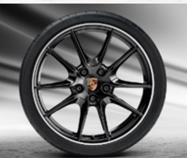
20-inch Carrera S wheels painted in Black Satin<sup>1)</sup>